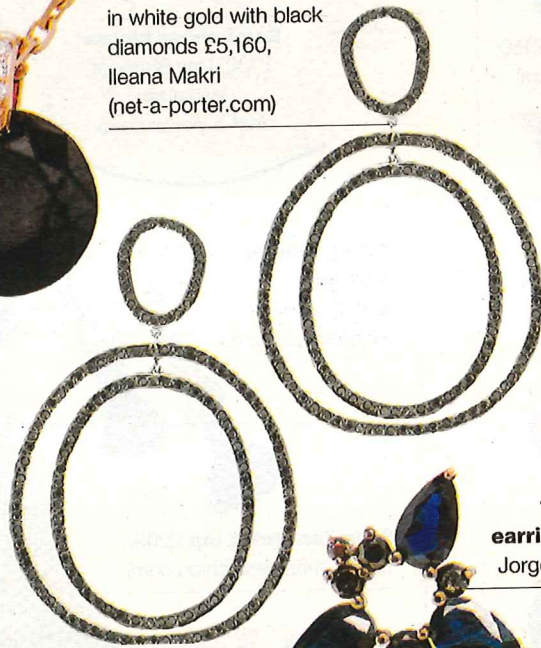
Again earrings in white gold with black diamonds £5,160, Ileana Makri ( net-a-porter.com )