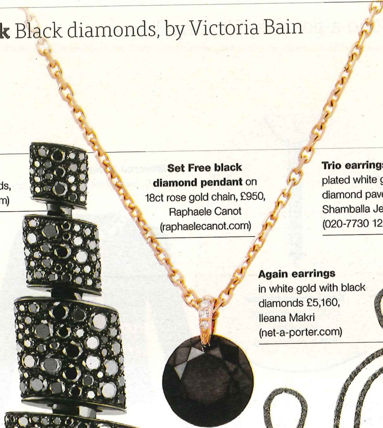
Trio earrings in 18ct rhodium-plated white gold with black diamond pavés, £11,300, Shamballa Jewels at Harrods (020-7730 1234)