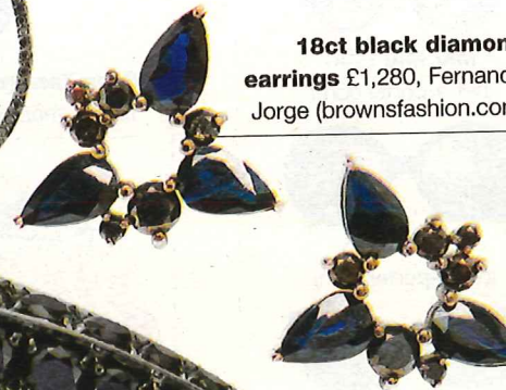
18ct black diamond earrings £1,280, Fernando Jorge ( brownsfashion.com )